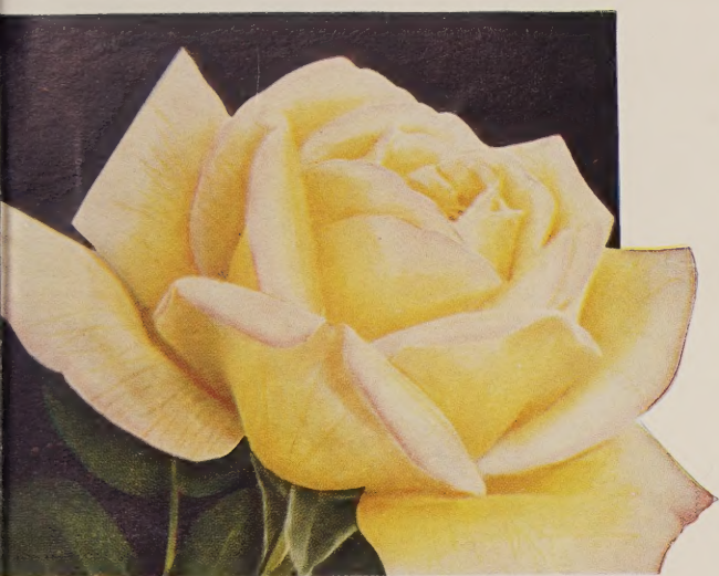
PEACE (Pat. 591)